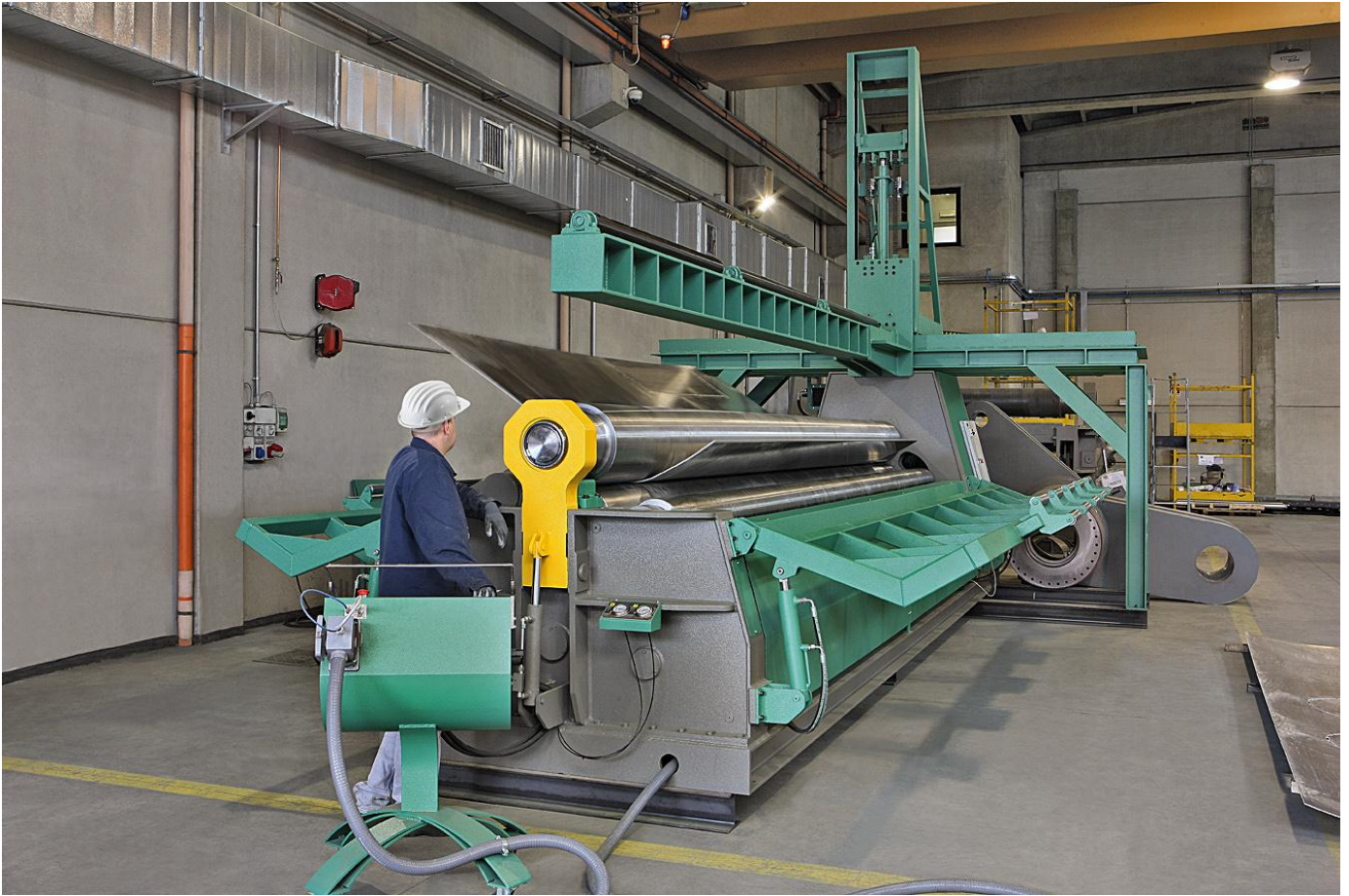
Plate bending machines: Lengths with multiple shapes

The optimization of the productive process leads companies to review their production phases and, where possible, cut down output time and costs. For example, in the construction of large tanks, the use of long plate bending machine helps to reduce further processes, such as welding, yet keeping a high quality standard.