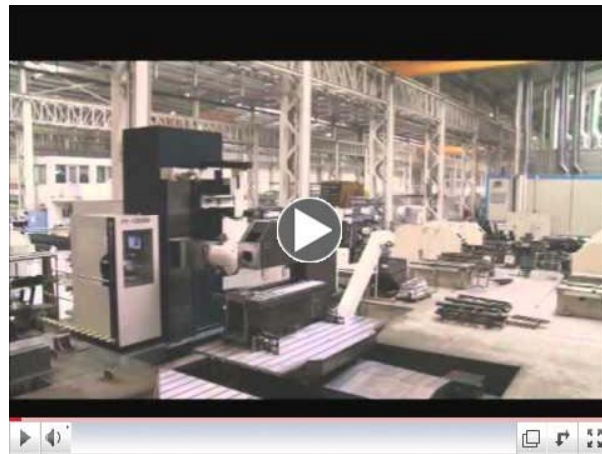
Introducing ERMAKSAN metal working product line.wmv

Click the picture below for a presentation on ERMAKSAN.